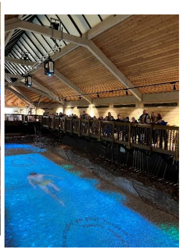
Class 4 - This week, Class 4 have come back to lots of learning opportunities. The children have started to explore a fun Shakespeare comedy, A Midsummer Night's Dream, and the bother that the Athenians create in the magical woods. They are also investigating Living Things and their Habitats in Science and have so far explored what it is like to be a Taxonomist. The children have also started their swimming lessons and the staff that attended said their behaviour was great and they listened well in their lesson – I'm sure we are going to see some great progress this term for them. They have also been lucky enough to start to explore Greek cuisines and some were very brave this week, trying some new foods such as olives, feta cheese and hummus.