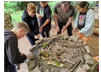
Skills for Learning, Learning for Life